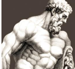
THE STARK CENTER