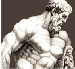
THE STARK CENTER