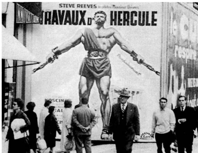
This French Hercules poster was literally larger than life.