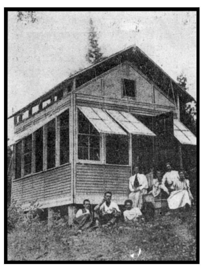
In the summer, many of Yungborn's guests stayed in 'air cabins" which were specially constructed to maximize circulation. Note the special roof construction to allow "healing" fresh air to constantly circulate though the building.

Groundless conjecturing was an unfortunate enough weakness. Worse was the willingness to accept into the naturopathic fold any therapeutic modality presented as "natural," no matter how outlandish the