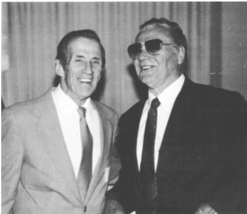
JOHN GRIMEK, SHOWN HERE WITH THE RECENTLY DECEASED ED JUBINVILLE, WAS HONORED IN 1986 BY THE OLDTIME BARBELL AND STRONGMAN ASSOCIATION FOR A LIFETIME OF ACHIEVEMENT IN THE IRON GAME. JOHN WAS A UNANIMOUS CHOICE OF THE SELECTION COMMITTEE WHO INDUCTED HIM DURING ASSOCIATION'S FIRST AWARDS DINNER. GRIMEK IS EIGHTY-ONE IN THIS PHOTOGRAPH.

The only time I remember the deadlift bar backfiring on them was when they challenged Ken MacDonald, the Australian heavyweight—an innocent visitor!—to try a 225 clean without a warmup. The deadlift bar was resting on the platform loaded with what appeared to be a pair of forty-fives on each end. The inside “forty-fives” weighed seventy-five each and the outside pair weighed fifty each. Actual weight 295. MacDonald crouched, secured his grip, and began to pull. When he felt the added poundage he smoothly turned up the power, pulling in the barbell as he dropped neatly into a squat and completed the clean. All the humorists concentrated on whatever exercises they were doing at the time. MacDonald never commented on the weight. He just sat it down nonchalantly