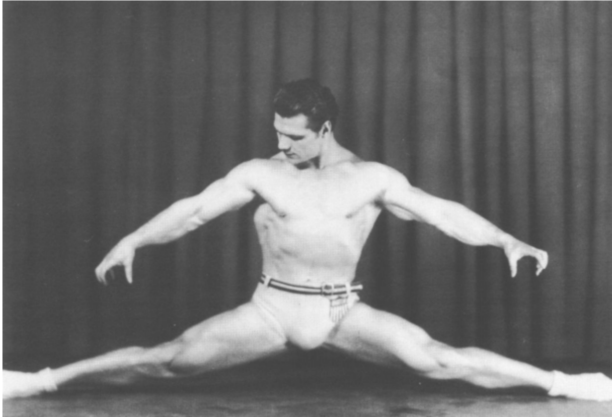
JOHN GRIMEK'S EXCEPTIONAL FLEXIBILITY HELPED TURN THE TIDE FOR THE ACCEPTANCE OF WEIGHT TRAINING BY ATHLETES.