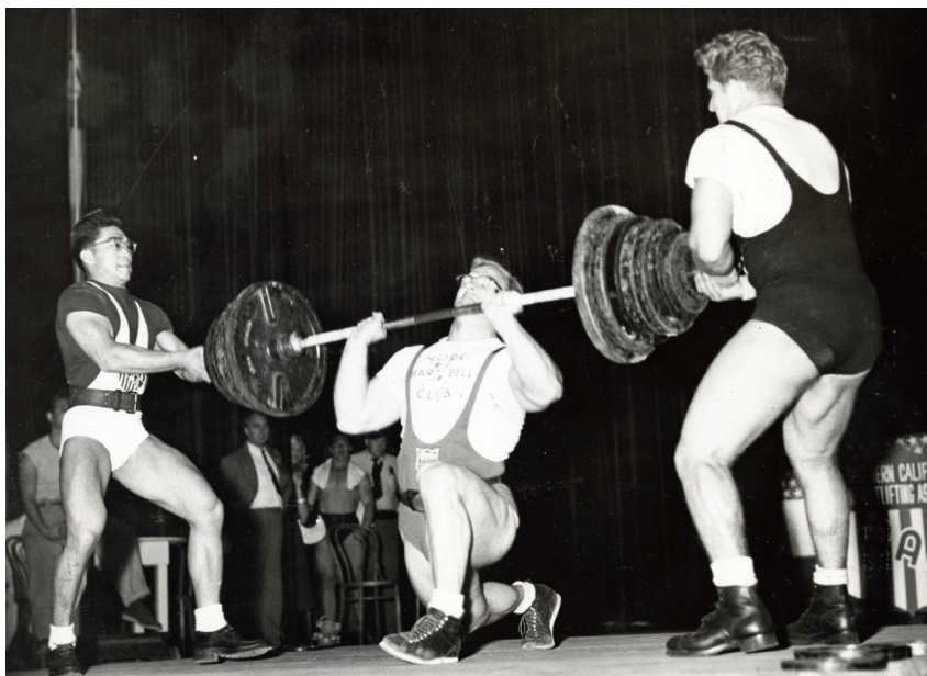
Schemansky, during a brief time after he unseated John Davis as weightlifting's reigning heavyweight, held the world record in the clean and jerk. He is shown here attempting, and failing, to jerk from the shoulders a weight reported to be 450 pounds. During this exhibition he was spotted by fellow legends Tommy Kono on the left and Clyde Emerich on the right. Emerich, after a distinguished weightlifting career, joined the Chicago Bears in 1972 as their first strength coach, and holds the record as the longest-serving Bears' employee.

young man just getting started in the publishing business. I was only 17 when I published my first issue of Your Physique , and I filled each issue with information about the great lifters of the past and present. I also continued to train very fiercely on the "Olympic Lifts" throughout the 1940s and beyond, and as Your Physique prospered I began another magazine— Muscle Power —that ran feature stories and news every month about weightlifting. In the early days I ran many, many stories about the lifting exploits of the man we all knew as "Ski." My readers liked the way he looked and lifted, and so did I.